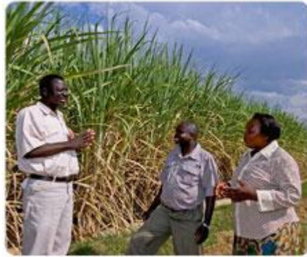
Picture 3: Sugar Cane farmers at Pongola

The aim of the programme was to conduct the pilot implementation of a high-technology system to provide practical, real-time irrigation advice to small sugar cane farmers in South Africa. The system consists of a web-based simulation model that estimates the recent, current and future water balance, crop status and yield from field information and real-time weather data. The system automatically generates and distributes simple irrigation advice by SMS to farmers' cellular phones.